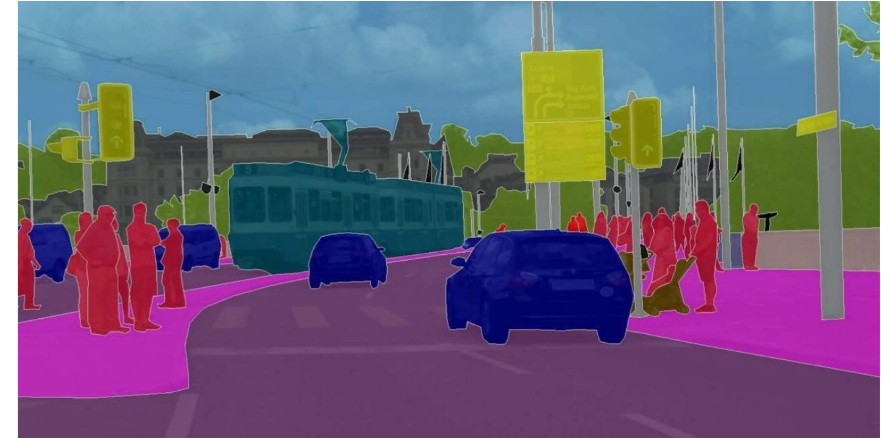
Figure 3: Semantic segmentation sample image