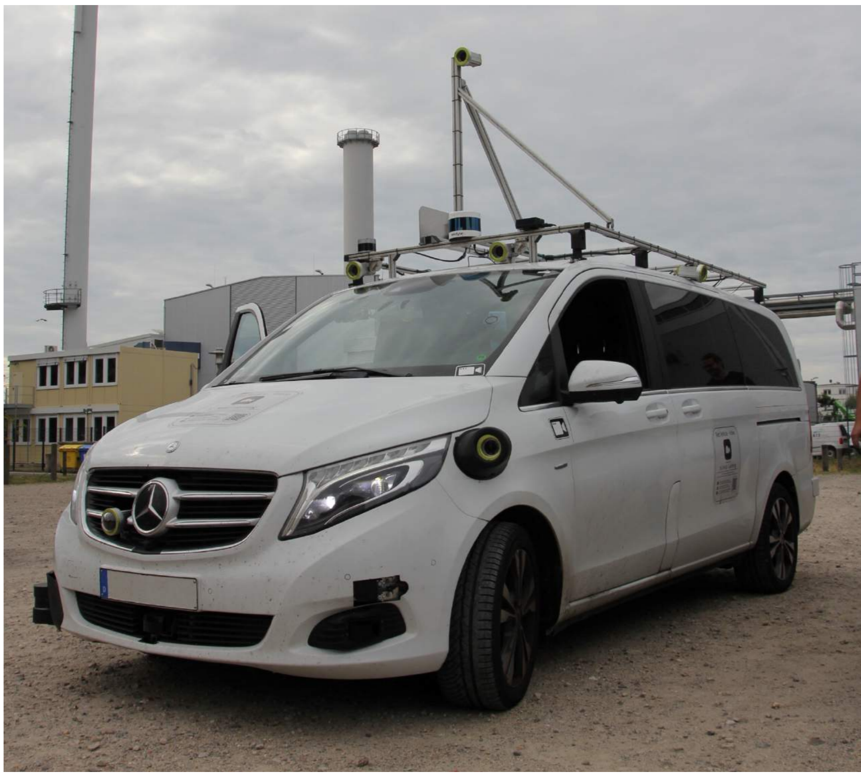
Figure 1: Research vehicle from the project consortium

All the sensors were co-calibrated and synchronized via precision time protocol.